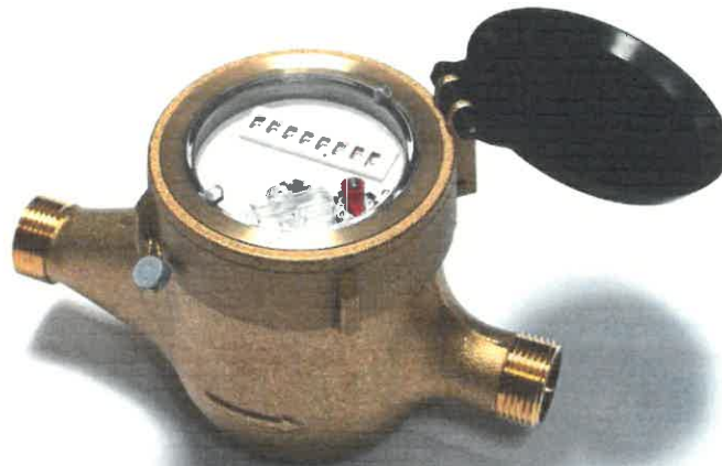
Figure 7: The water meter type SV-RTK (E8) DN 15 with plastic body – view and sealing: