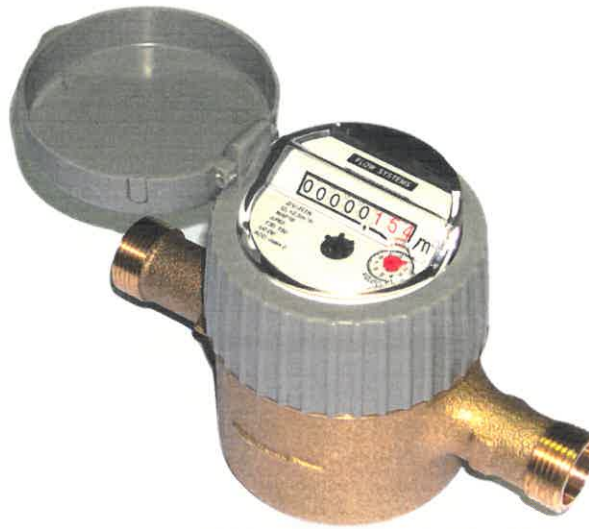
Figure 3: The water meter type SV-RTK (E4) – view and sealing: