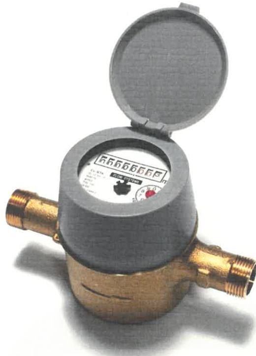
Figure 5: The water meter type SV-RTK (E4) with plastic body – view and sealing: